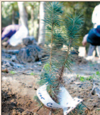
New trees for Camp Darby