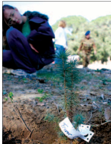
(Above) Students tagged the new trees they planted with their name. The trees development is followed closely as the pines in the Tuscan region being ravaged by the Matuscoccus feytau virus.

The park rangers said they were pleased the students were able to learn first hand about the importance of protecting the environment.