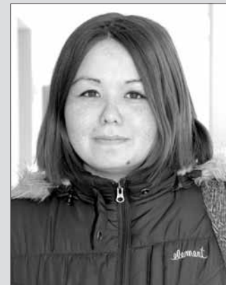
Jennifer White Child Development Center

I would say the greatest impact on me is that it affects my sleep by waking earlier.