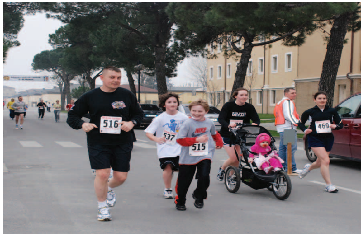
(Above) Individuals, groups, families and friends all came together for the monthly 5km Fun Run/Walk through Caserma Ederle. The events is held on Saturday mornings starting from the North-40 track.

Another family who had the chance to run together for their second time enjoyed the event.