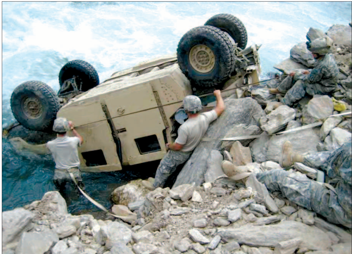
(Above) Paratroopers of Bravo Troop, 1st Squadron, 91st Cavalry Regiment (Airborne), recover a vehicle out of a river during the summer near Forward Operating Base Keating in Nuristan Province, Afghanistan. The road gave way during a patrol causing the vehicle to roll over.

“One of the things about the snow, when it fell, it made things very difficult around here,” said